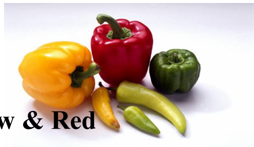
Yellow & Red Peppers